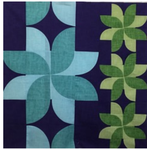
Wall Hanging 36" x 36"

This workshop introduces quilters to the 3" & 6" On The Edge set of cutting templates. Although at first glance the template pieces appear to be the same as the Basic Set, there are small differences which create an entirely different design – most notably the tapered edges of the "L-Shape" and "The Wave" pieces (see photos on page 2.)