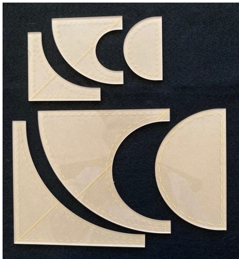
3" + 6" On The Edge Template Set

Kit Fee: $29.95 + tax for the 3" & 6" On The Edge template set